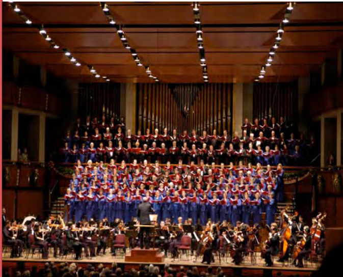
The American Youth Philharmonic and the Choral Arts Society of Washington make an impressive group as they perform together at the Kennedy Center in a series of three Christmas concerts in December 2004.