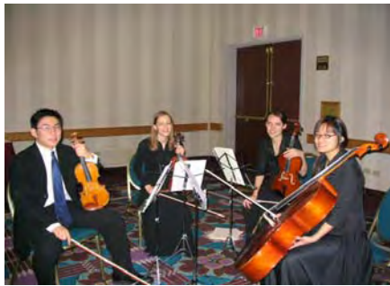
AYP String Quartet members perform at a banquet for military reserve officers.

March brought two more chamber performances – the first on March 2 nd for the Arts Council of Fairfax County's annual meeting. Three members of the cello quartet once again shared their talents with many of Northern Virginia's arts leaders that evening. The following week, another AYP string quartet performed for our nation's military reserve officers, at a graduation banquet for those