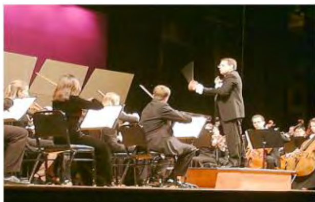
The American Youth Philharmonic today