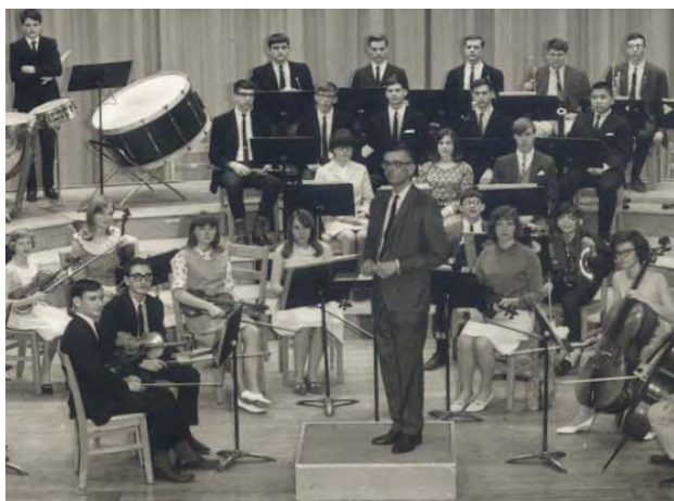
The Northern Virginia Youth Symphony Orchestra in its first season, 1965-1966